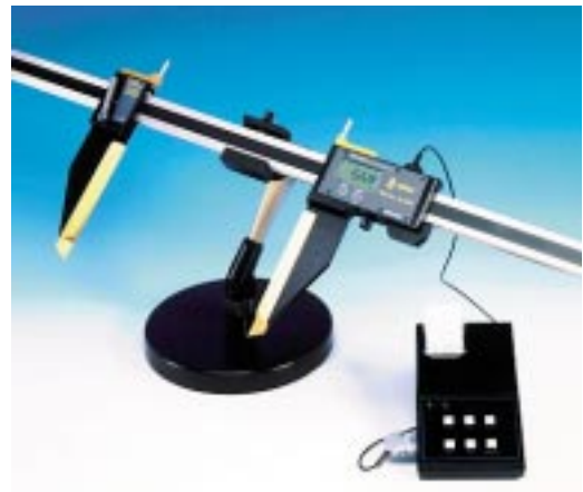
▲ 54-110-000 stand shown with caliper & printer.