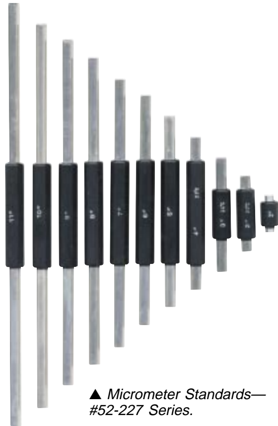
▲ Micrometer Standards—#52-227 Series.