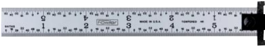
▲ Hook Rule #52-330-806