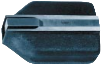
Base Block #53-700-005.