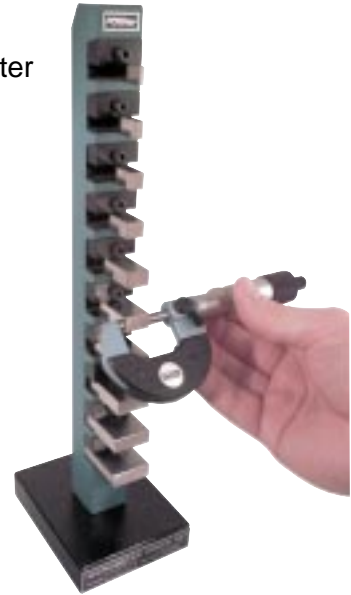
right: 53-813-001 Outside Micrometer Checker