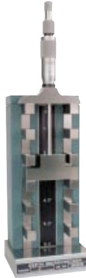
left: 53-813-005 Depth Micrometer checker