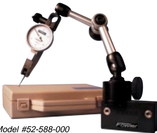
▲ Model #52-588-000

Fowler's indicator holder is a unique three-dimensional system with fine adjustment at the base, allowing fast zeroing.