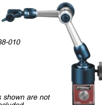
▲ Model #52-588-010

Introducing Fowler's new measuring articulated magnetic bases with central clamping system, on/off switch and fine adjustment