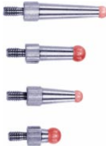
▲ 52-525 Series Contact points