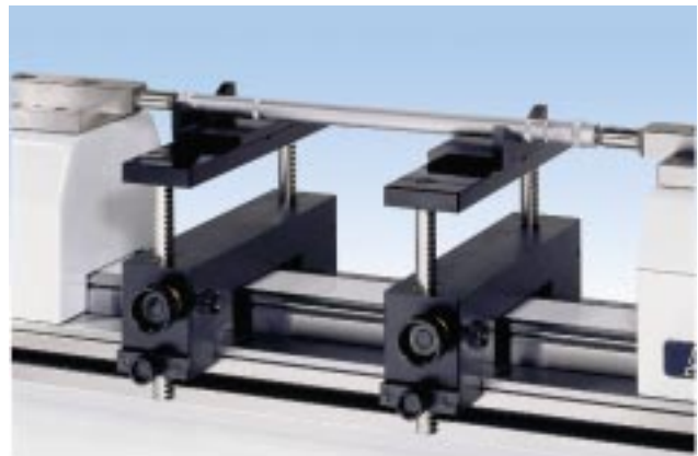
▲ checking and setting of internal micrometers using 54-196-107 & 54-196-021