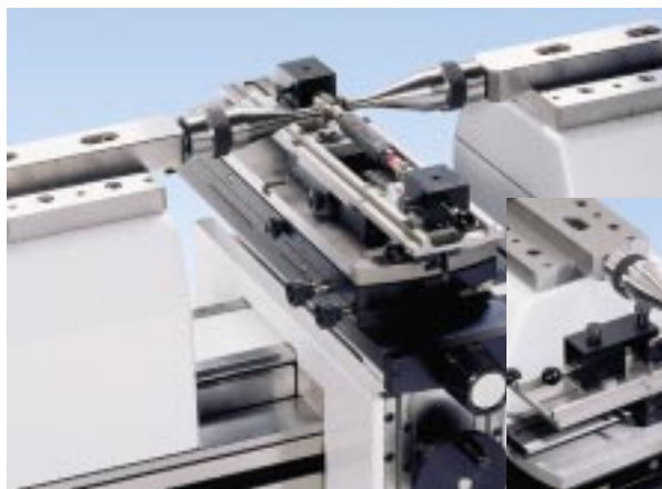
checking of plug gages and threaded plug gages between centers up to max. dia. 1.18"/30mm, max. length 6"/150mm using 54-197-011, 54-197-106, 54-197-806 & 54-197-007