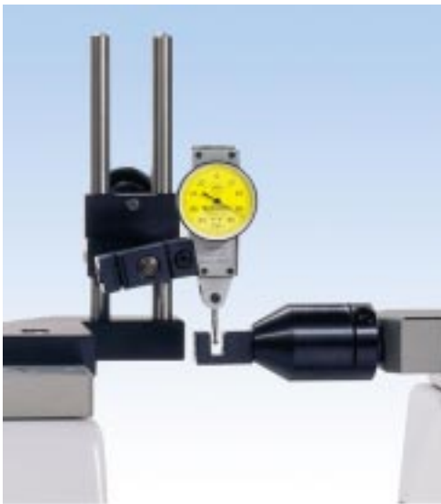
▲ checking of lever (test) dial indicators using 54-197-115