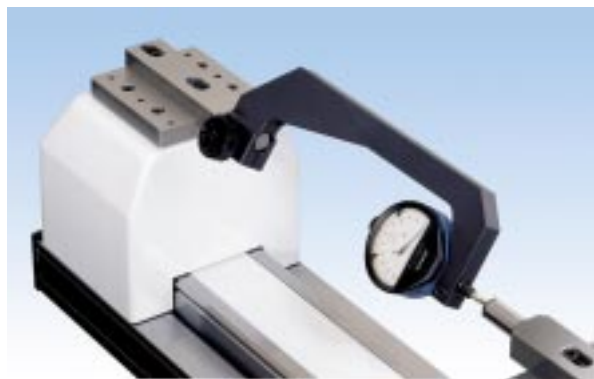
▲ checking of dial indicators and dial comparators up to 2"/50mm range using 54-197-015