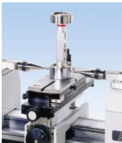
▲ checking of plug gages and threaded plug gages from dia. 1.18" to 10"/30 to 250mm using 54-197-011, 54-197-142, 54-190-806 & 54-197-007