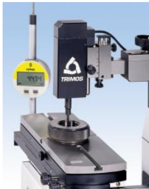
▲ checking of threaded ring gages from pitch 0.7 to 6mm/48 to 4 threads per inch (max. internal dia. 7.08"/180mm) using 54-197-011, 54-197-142, 54-197-074 & 54-197-075