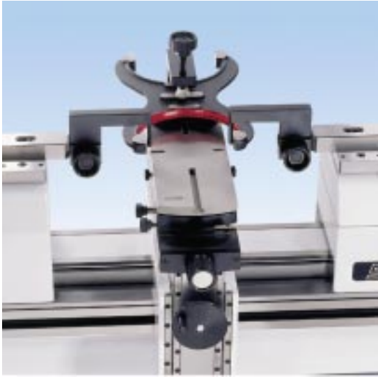
▲ checking of snap gages with range from .473 to 6"/12 to 150mm using 54-197-011, 54-197-014 & 54-197-162