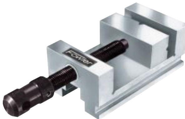
▲ Toolmaker Vise No. 52-466-000.